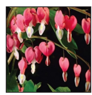
2 Bleeding Heart