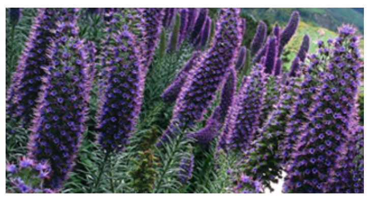
The fastest way to help is to buy any of these beautiful gardening products: