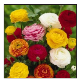
15 Persian Buttercups