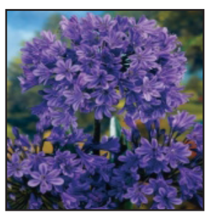
2 Agapanthus Blue