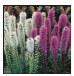
12 Blue & White Liatris